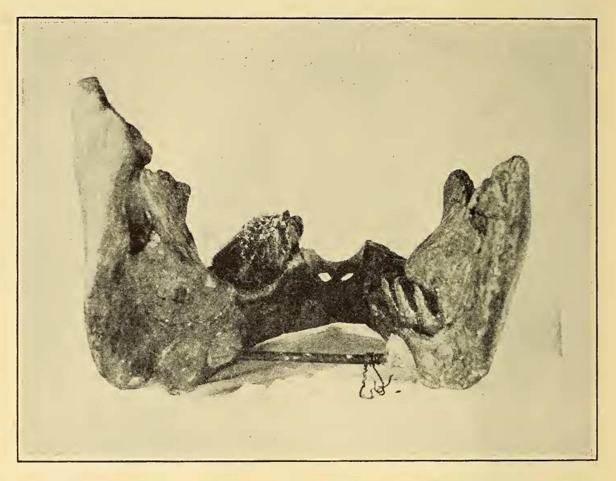
Fig. 2.—Lower mandible from the rear, showing adjustment caused by the impacted tooth at right (as figured).

There is some question as to the locality from which these bones were collected, and by whom collected. Tradition has it that they were collected by Thomas Jefferson. It seems unnatural, however, for a man who had so great an interest in the study of such fossils, and who wrote so many letters on the subject, not to have mentioned in some of these an event of such importance as his own personal collection of so